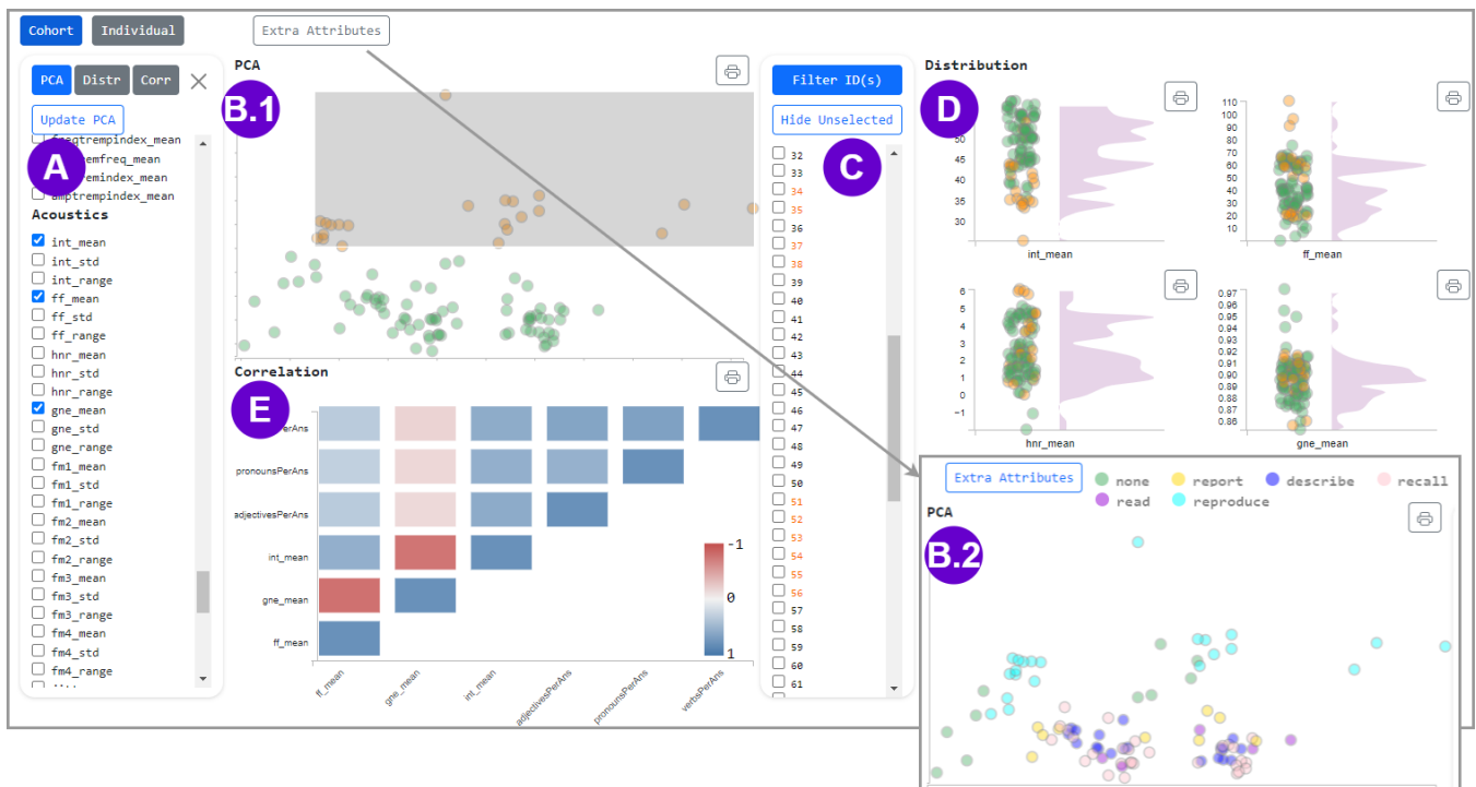
Figure 2: Cohort Panel. A) Query Subpanel with three alternative components for biomarker variable selection for views B, D, E. B.1) PCA View that uses a scatterplot to display in 2D video data based on the variable selections in A. B.2) The PCA scatterplot is color-coded based on an extra attribute, namely, the task that was performed during each video. C) ID Query Subpanel where IDs can be selected to be highlighted in views B and D, and unselected IDs can be hidden. D) Distribution View showing cohort distributions for four selected variables. E) Correlation View displaying pairwise Pearson correlation coefficients for six selected biomarker variables.

first two components computed by a Principal Component Analysis (PCA) [53]. We employed factor analysis (i.e. PCA) to help researchers get a better sense of underlying structures in the high-dimensional video data while retaining patterns. The view shows trends and outliers, while brushing interactions highlight selected elements in the Distribution View and ID query subpanel.